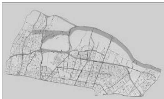
F2. The zoning map of faults in District 4 of Tehran.